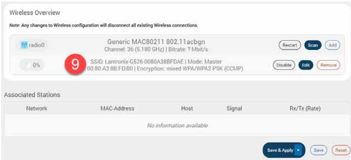
Figure 4: Default AP SSID